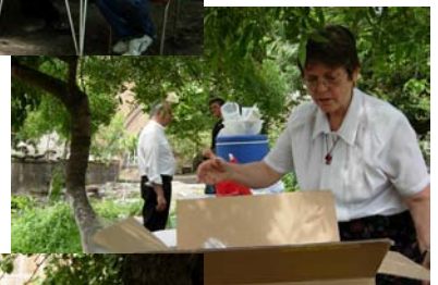
What's all the fuss? It's only . . . .