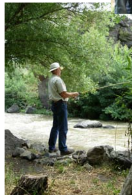
Fisher of Men? (certainly no fish!)