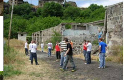
It's getting closer! Run faster!