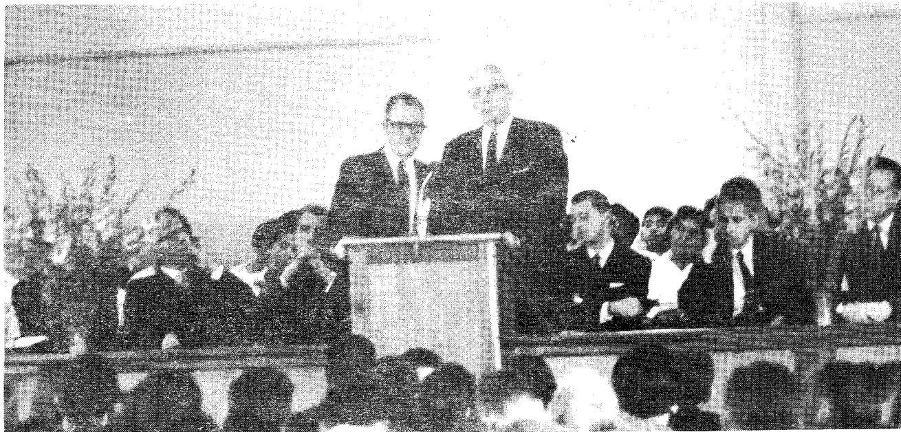
GUATEMALA STAKE CONFERENCE PRESIDED BY ELDER STERLING W. SILL---Oct 15